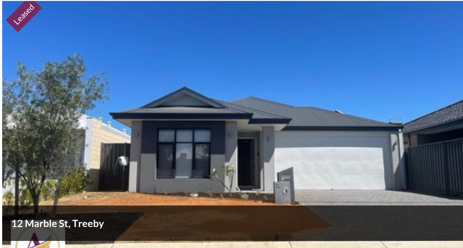
12 Marble St, Treeby