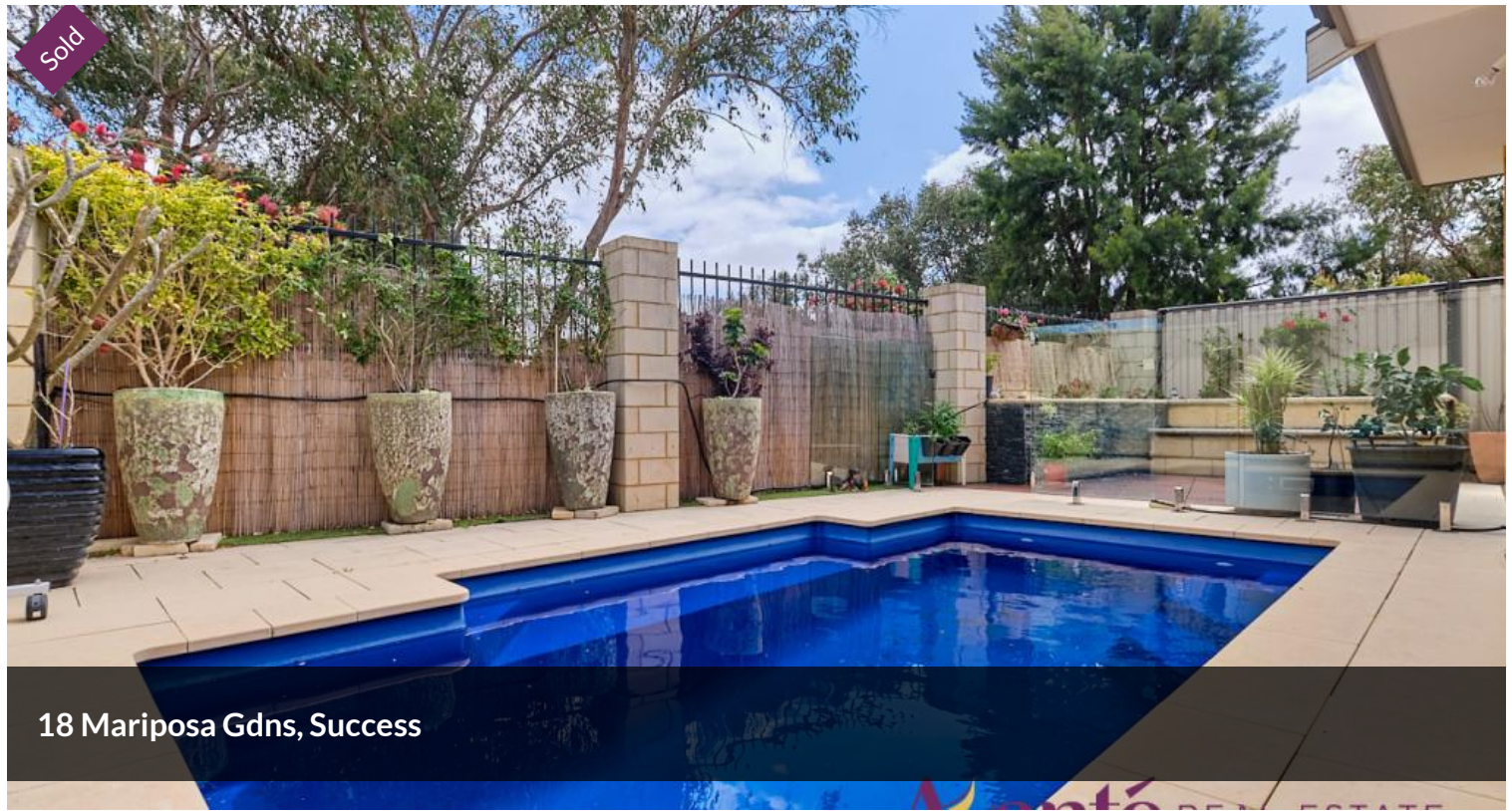
18 Mariposa Gdns, Success