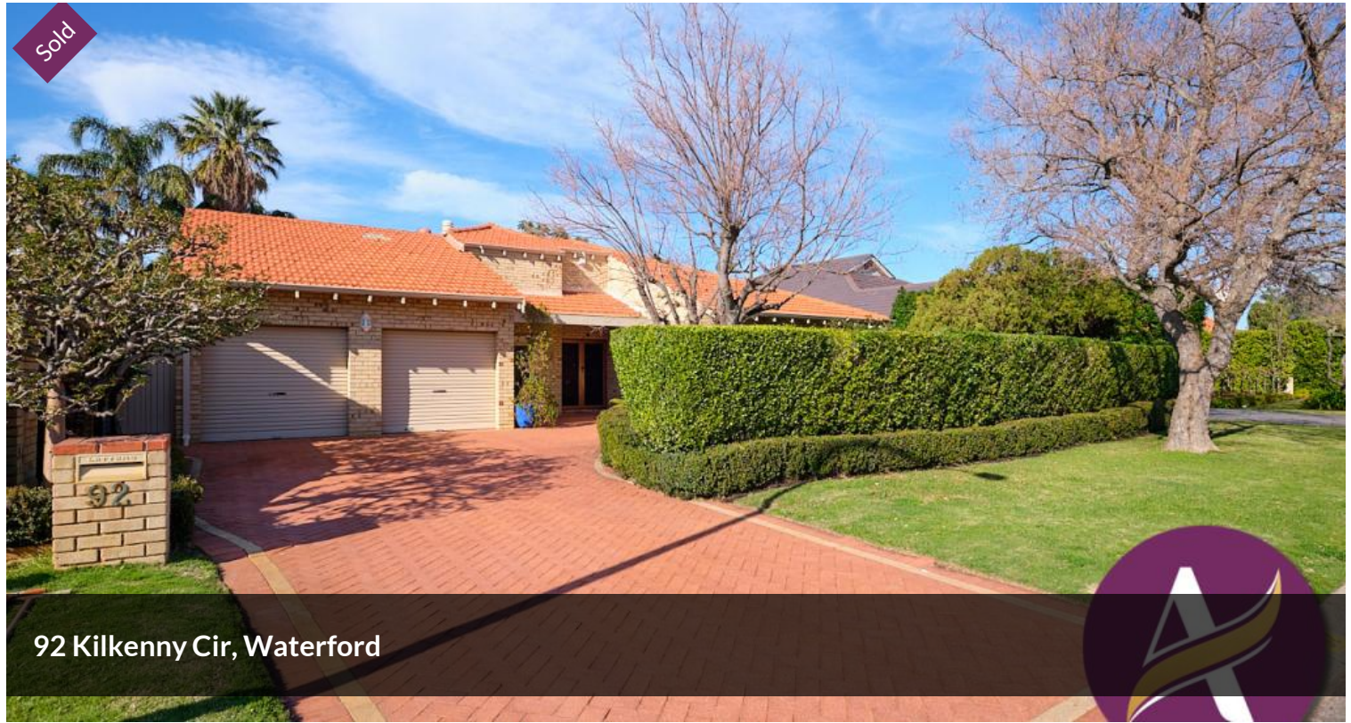
92 Kilkenny Cir, Waterford